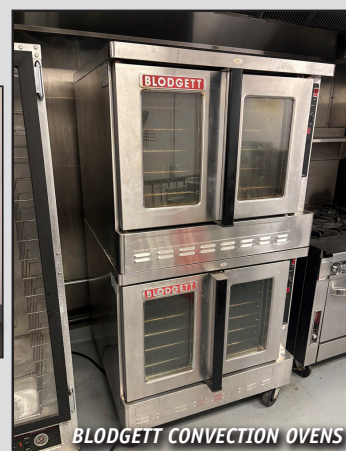
BLODGETT CONVECTION OVENS