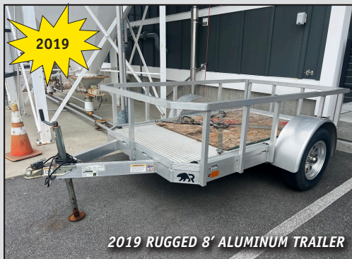
2019 RUGGED 8' ALUMINUM TRAILER

★ 2019 Rugged 8' x 5' S/A Aluminum Trailer, Vin #1F9F1U819KH475035 ★