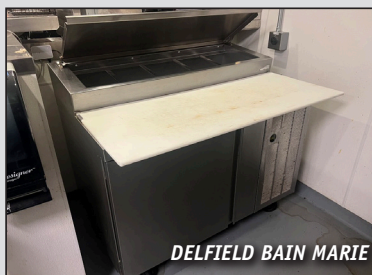
DELFIELD BAIN MARIE