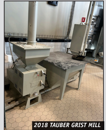
2018 TAUBER GRIST MILL