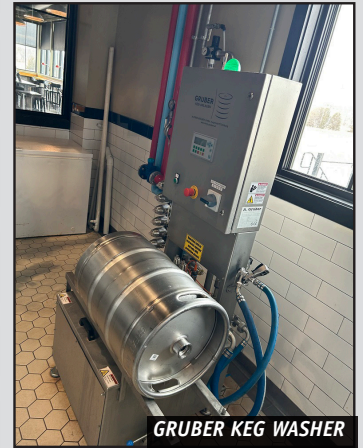
GRUBER KEG WASHER