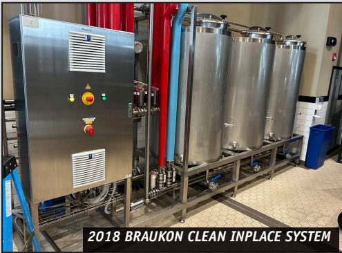
2018 BRAUKON CLEAN INPLACE SYSTEM