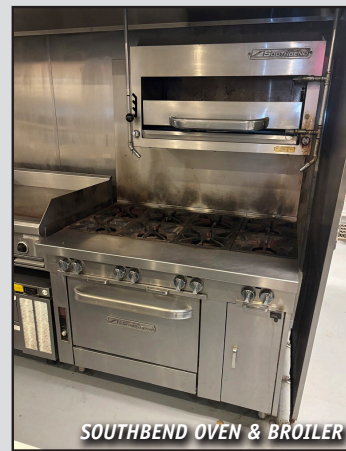
SOUTHBEND OVEN & BROILER