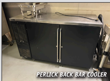
PERLICK BACK BAR COOLER