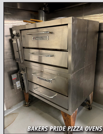
BAKERS PRIDE PIZZA OVENS