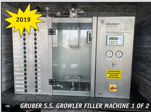
GRUBER S.S. GROWLER FILLER MACHINE 1 OF 2