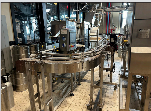
OVERVIEW OF BREWERY