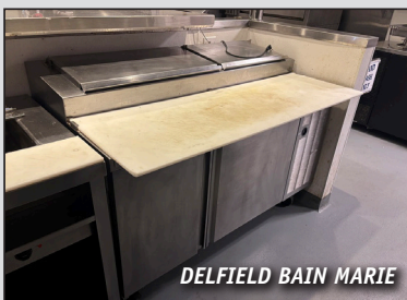
DELFIELD BAIN MARIE