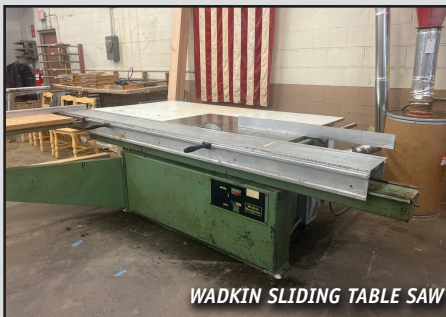
WADKIN SLIDING TABLE SAW

WEDNESDAY, FEBRUARY 11 TH AT 11:00 A.M. (ET) 3 WELLS ROAD WETHERSFIELD, CONNECTICUT