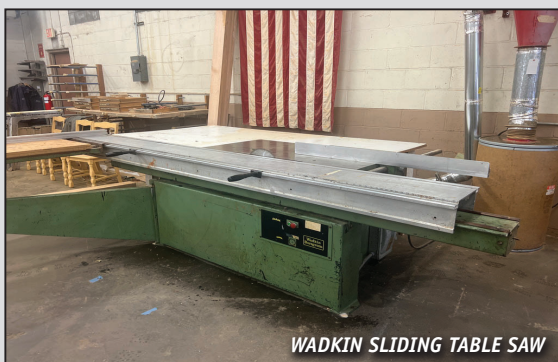
WADKIN SLIDING TABLE SAW