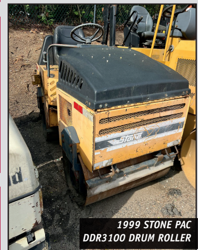
1999 STONE PAC DDR3100 DRUM ROLLER