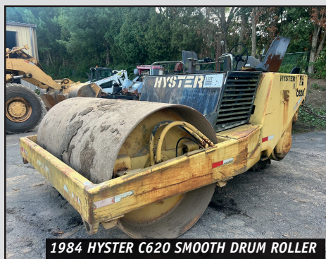
1984 HYSTER C620 SMOOTH DRUM ROLLER