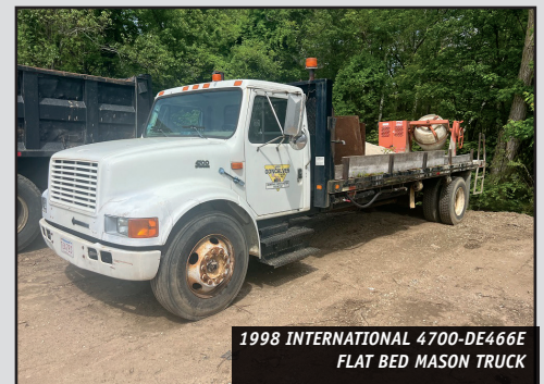
1998 INTERNATIONAL 4700-DE466E FLAT BED MASON TRUCK