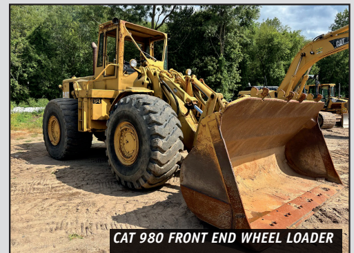
CAT 980 FRONT END WHEEL LOADER