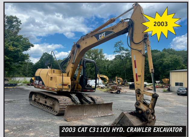
2003 CAT C311CU HYD. CRAWLER EXCAVATOR