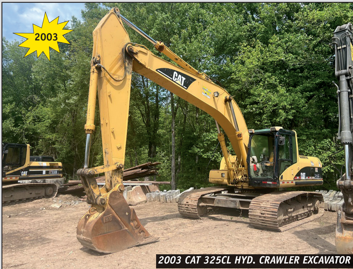
2003 CAT 325CL HYD. CRAWLER EXCAVATOR

THURSDAY, SEPTEMBER 25 TH AT 11:00 A.M. (ET)