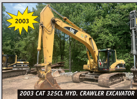
2003 CAT 325CL HYD. CRAWLER EXCAVATOR

THURSDAY, SEPTEMBER 25 TH AT 11:00 A.M. (ET) 172 MUNSING STREET LUDLOW, MASSACHUSETTS