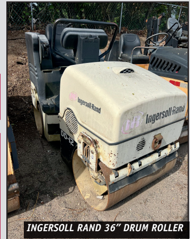
INGERSOLL RAND 36" DRUM ROLLER