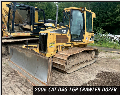
2006 CAT D4G-LGP CRAWLER DOZER