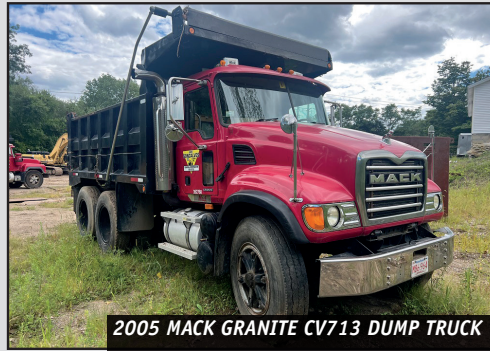
2005 MACK GRANITE CV713 DUMP TRUCK