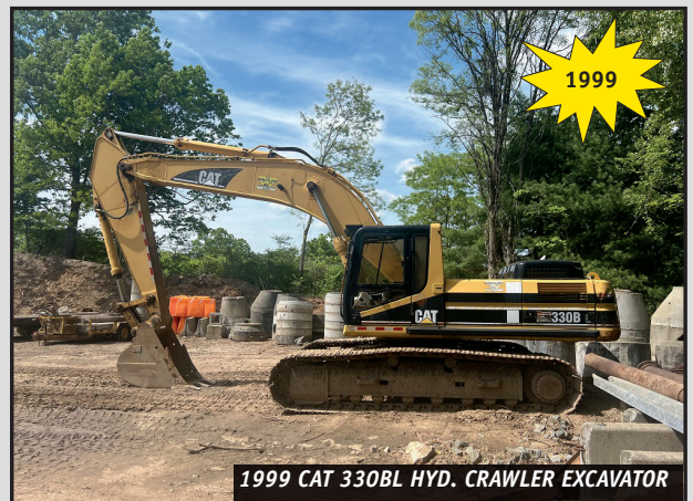
1999 CAT 330BL HYD. CRAWLER EXCAVATOR