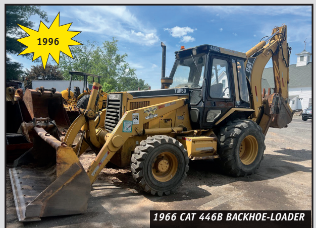
1966 CAT 446B BACKHOE-LOADER