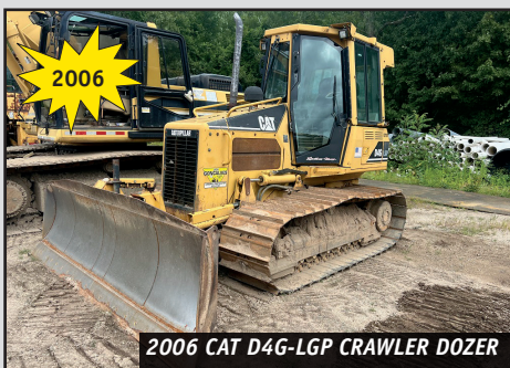
2006 CAT D4G-LGP CRAWLER DOZER

If you can't personally attend the auction sale, you don't have to miss out on the bidding. You can bid on the equipment in the following ways: