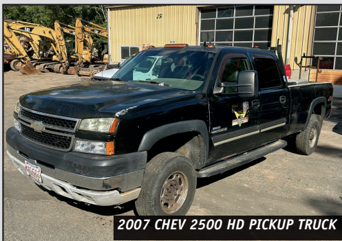
2007 CHEV 2500 HD PICKUP TRUCK