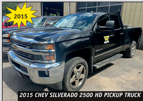
2015 CHEV SILVERADO 2500 HD PICKUP TRUCK