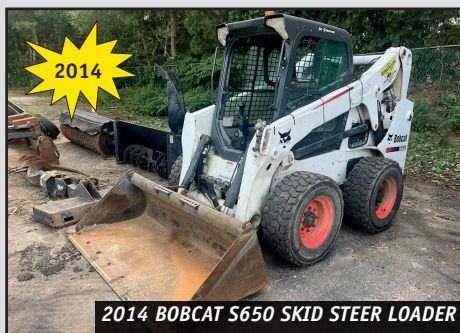
2014 BOBCAT S650 SKID STEER LOADER