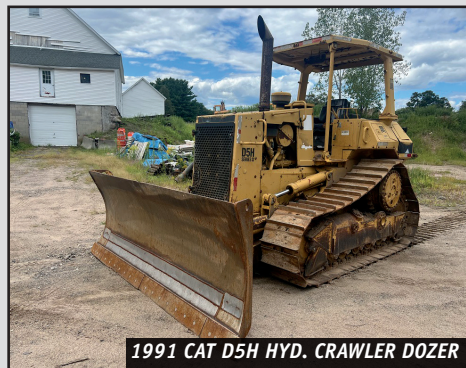
1991 CAT D5H HYD. CRAWLER DOZER