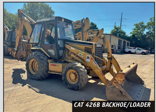
CAT 426B BACKHOE/LOADER