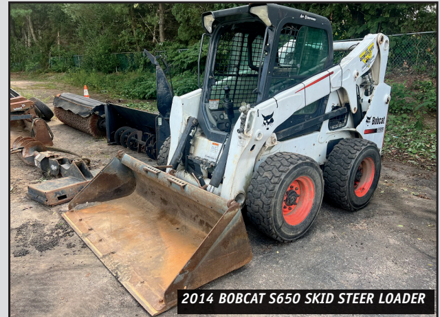
2014 BOBCAT S650 SKID STEER LOADER