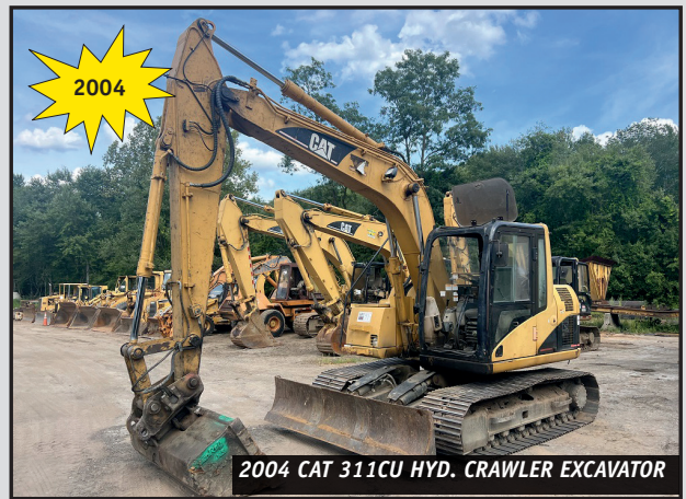
2004 CAT 311CU HYD. CRAWLER EXCAVATOR

THE INFORMATION DESCRIBED IN THIS BROCHURE IS CORRECT TO THE BEST OF OUR KNOWLEDGE BUT WE CANNOT GUARANTEE SAME. IT IS FOR THIS REASON THAT BUYERS SHOULD AVAIL THEMSELVES OF THE OPPORTUNITY FOR INSPECTION PRIOR TO THE SALE.