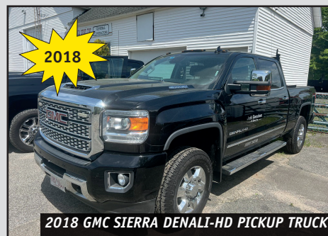
2018 GMC SIERRA DENALI-HD PICKUP TRUCK