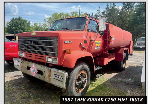
1987 CHEV KODIAK C750 FUEL TRUCK