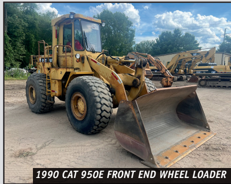
1990 CAT 950E FRONT END WHEEL LOADER