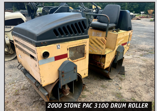
2000 STONE PAC 3100 DRUM ROLLER