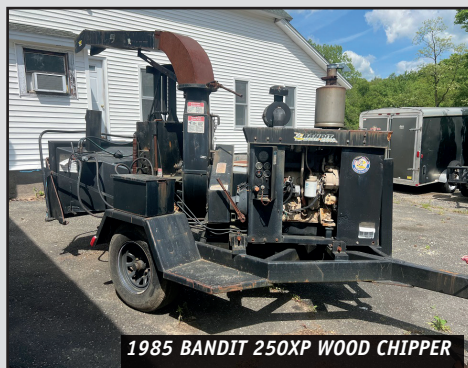
1985 BANDIT 250XP WOOD CHIPPER