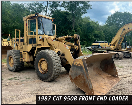
1987 CAT 950B FRONT END LOADER