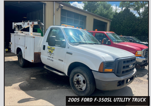
2005 FORD F-350SL UTILITY TRUCK