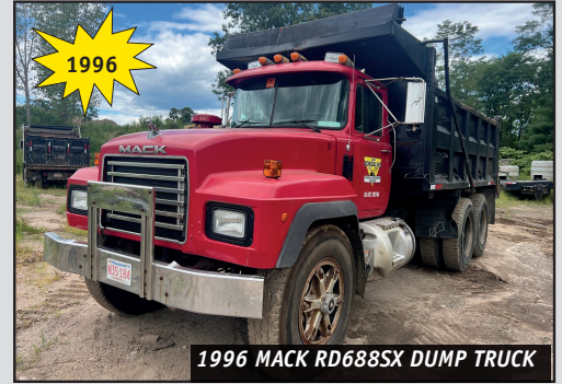
1996 MACK RD688SX DUMP TRUCK