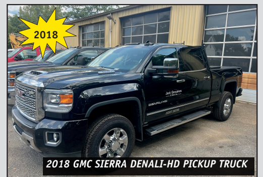
2018 GMC SIERRA DENALI-HD PICKUP TRUCK