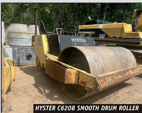
HYSTER C620B SMOOTH DRUM ROLLER