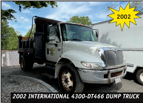
2002 INTERNATIONAL 4300-DT466 DUMP TRUCK

THURSDAY, SEPTEMBER 25 TH AT 11:00 A.M. (ET)