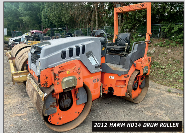
2012 HAMM HD14 DRUM ROLLER