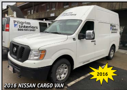
2016 NISSAN CARGO VAN

THE INFORMATION DESCRIBED IN THIS BROCHURE IS CORRECT TO THE BEST OF OUR KNOWLEDGE BUT WE CANNOT GUARANTEE SAME. IT IS FOR THIS REASON THAT BUYERS SHOULD AVOID THEMSELVES OF THE OPPORTUNITY FOR INSPECTION PRIOR TO THE SALE.