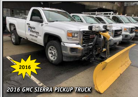
2016 GMC SIERRA PICKUP TRUCK