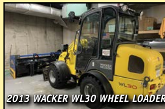
2013 WACKER WL30 WHEEL LOADER