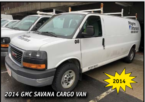
2014 GMC SAVANA CARGO VAN