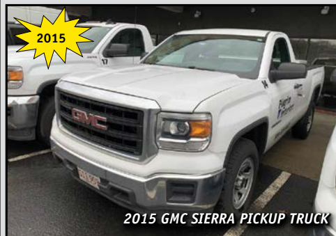
2015 GMC SIERRA PICKUP TRUCK