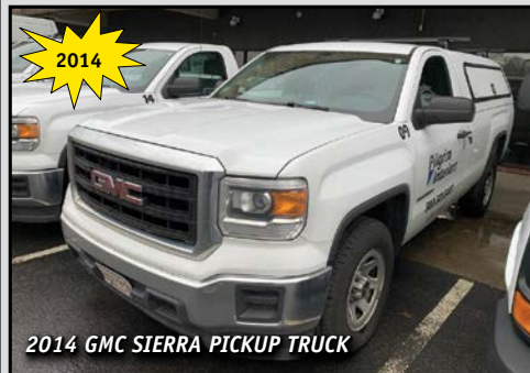
2014 GMC SIERRA PICKUP TRUCK