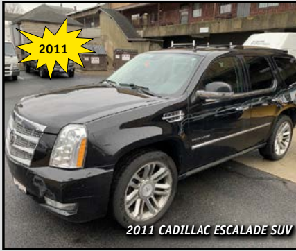
2011 CADILLAC ESCALADE SUV