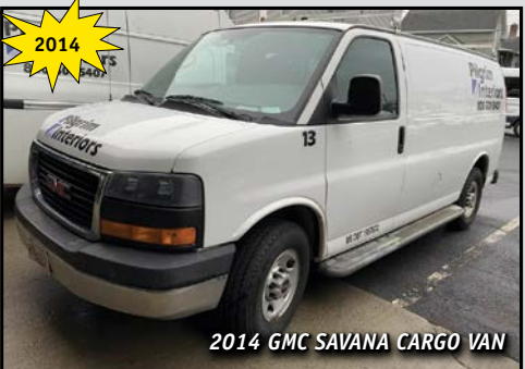
2014 GMC SAVANA CARGO VAN