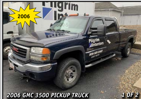
2006 GMC 3500 PICKUP TRUCK