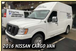
2016 NISSAN CARGO VAN