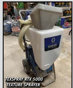
TEXSPRAY RTX 5000 TEXTURE SPRAYER