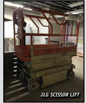
JLG SCISSOR LIFT