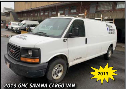
2013 GMC SAVANA CARGO VAN