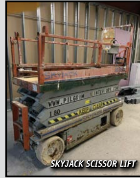
SKYJACK SCISSOR LIFT