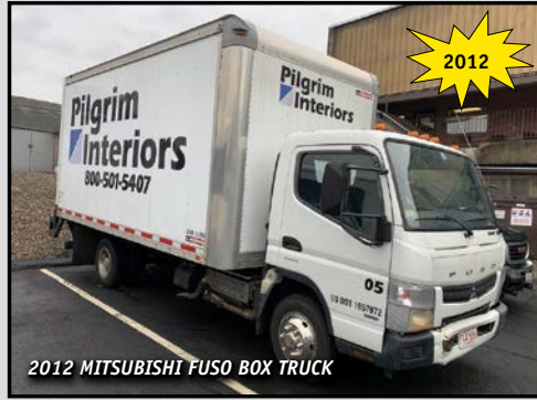
2012 MITSUBISHI FUSO BOX TRUCK