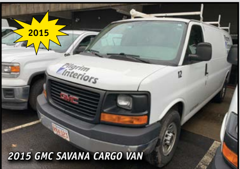
2015 GMC SAVANA CARGO VAN