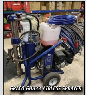
GRACO GH833 AIRLESS SPRAYER