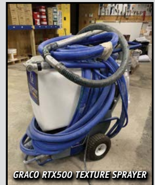
GRACO RTX500 TEXTURE SPRAYER