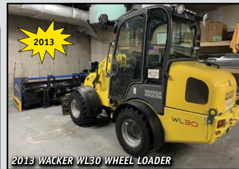
2013 WACKER WL30 WHEEL LOADER