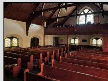
VIEW OF CHOIR LOFT