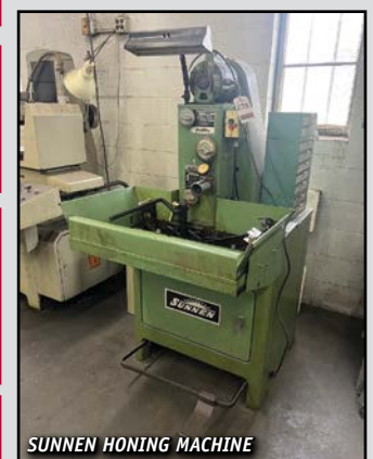
SUNNEN HONING MACHINE