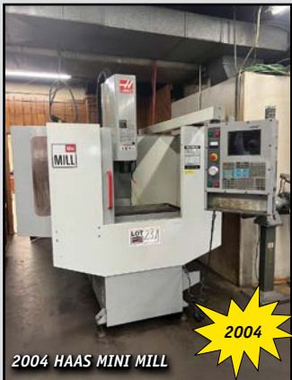
2004 HAAS MINI MILL