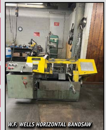
W.F. WELLS HORIZONTAL BANDSAW