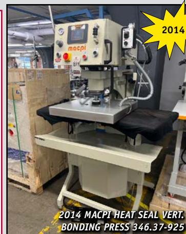
2014 MACPI HEAT SEAL VERT. BONDING PRESS 346.37-925