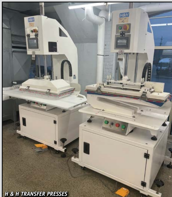
H & H TRANSFER PRESSES