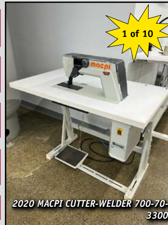
2020 MACPI CUTTER-WELDER 700-70-3300