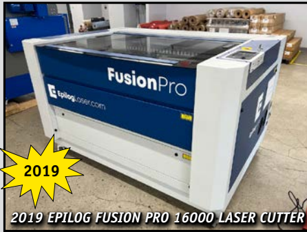
2019 2019 EPILOG FUSION PRO 16000 LASER CUTTER

THE INFORMATION DESCRIBED IN THIS BROCHURE IS CORRECT TO THE BEST OF OUR KNOWLEDGE BUT WE CANNOT GUARANTEE SAME. IT IS FOR THIS REASON THAT BUYERS SHOULD AVAIL THEMSELVES OF THE OPPORTUNITY FOR INSPECTION PRIOR TO THE SALE.