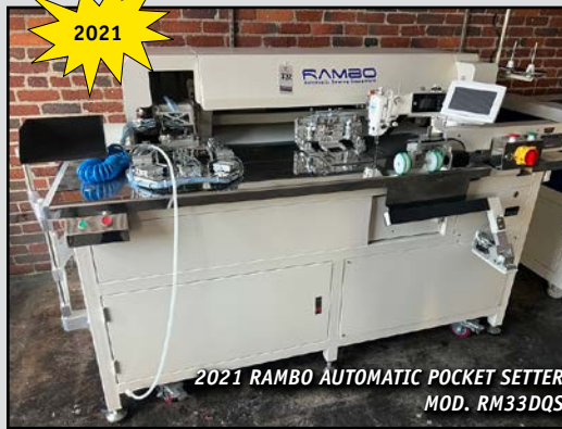
2021 RAMBO AUTOMATIC POCKET SETTER MOD. RM33DQS