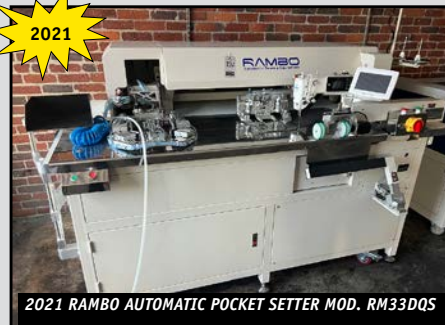
2021 RAMBO AUTOMATIC POCKET SETTER MOD. RM33DQ5