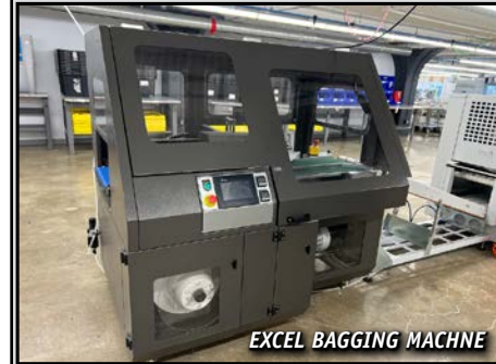
EXCEL BAGGING MACHINE