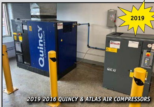
2019 2016 QUINCY & ATLAS AIR COMPRESSORS