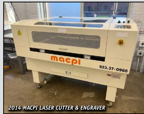
2014 MACPI LASER CUTTER & ENGRAVER