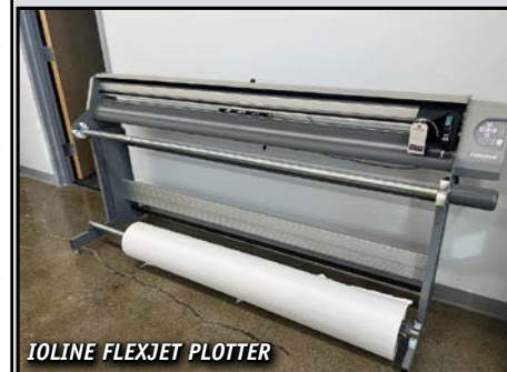
IOLINE FLEXJET PLOTTER