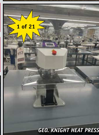
GEO. KNIGHT HEAT PRESS