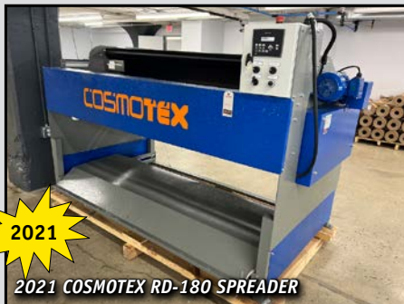
2021 2021 COSMOTEX RD-180 SPREADER