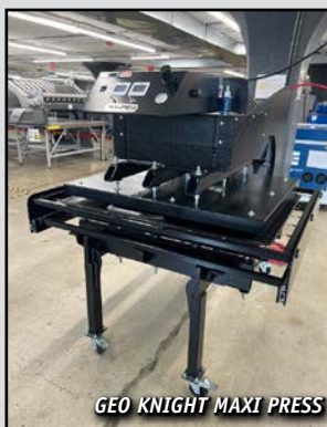
GEO KNIGHT MAXI PRESS