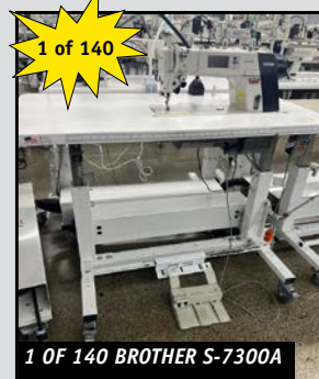
1 OF 140 BROTHER S-7300A