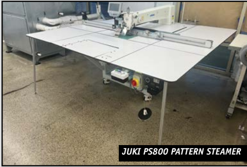
JUKI PS800 PATTERN STEAMER