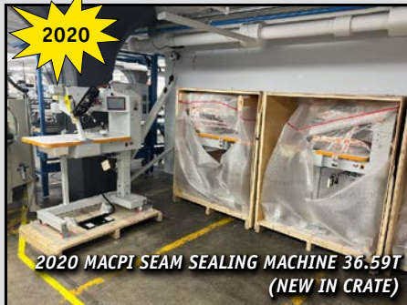
2020 2020 MACPI SEAM SEALING MACHINE 36.59T (NEW IN CRATE)