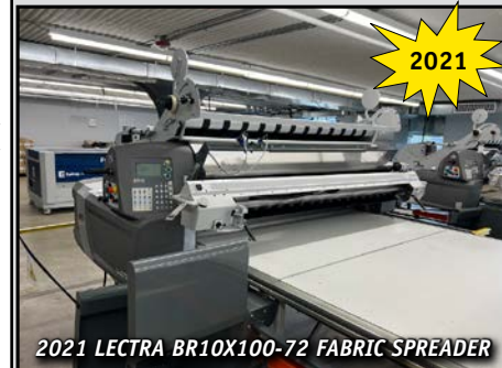
2021 2021 LECTRA BR10X100-72 FABRIC SPREADER