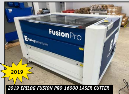
2019 EPILOG FUSION PRO 16000 LASER CUTTER