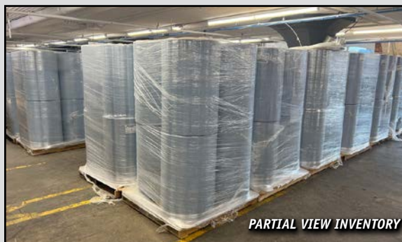
PARTIAL VIEW INVENTORY