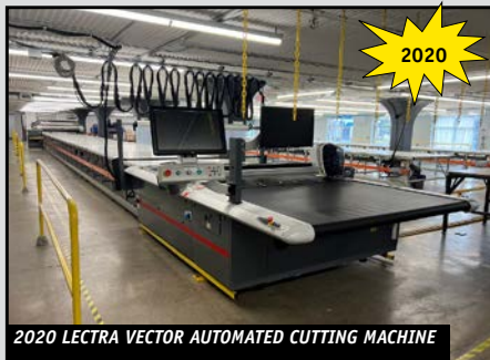
2020 LECTRA VECTOR AUTOMATED CUTTING MACHINE