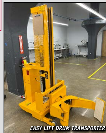
EASY LIFT DRUM TRANSPORTER