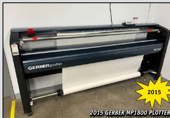
2015 GERBER MP1800 PLOTTER