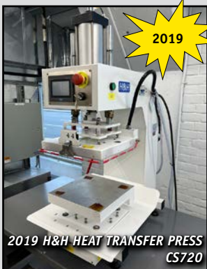
2019 H&H HEAT TRANSFER PRESS CS720