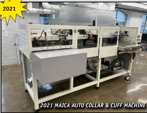
2021 MAICA AUTO COLLAR & CUFF MACHINE