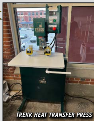
TREKK HEAT TRANSFER PRESS