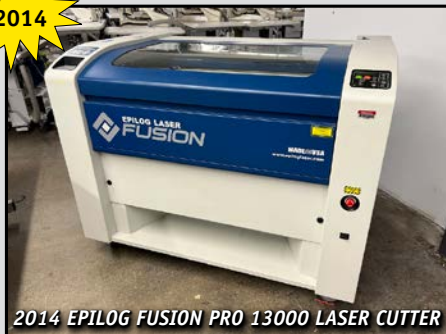
2014 2014 EPILOG FUSION PRO 13000 LASER CUTTER