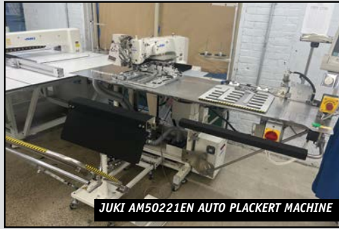
JUKI AM50221EN AUTO PLACKERT MACHINE