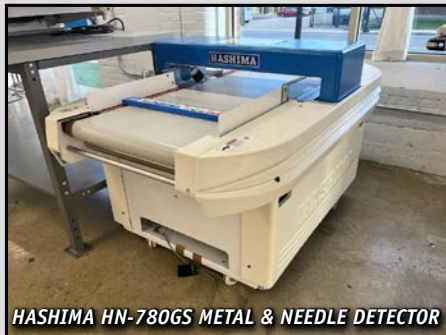
HASHIMA HN-780GS METAL & NEEDLE DETECTOR