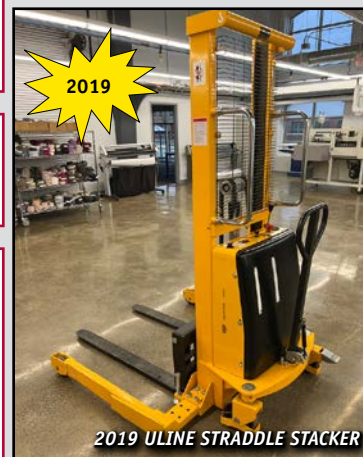
2019 ULINE STRADDLE STACKER