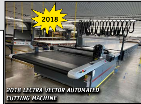
2018 2018 LECTRA VECTOR AUTOMATED CUTTING MACHINE