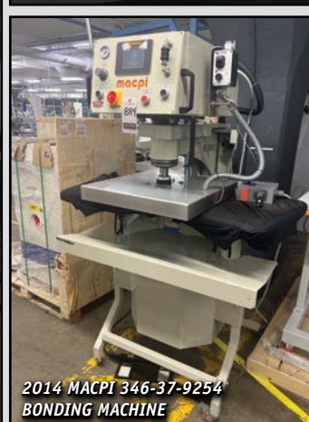
2014 MACPI 346-37-9254 BONDING MACHINE