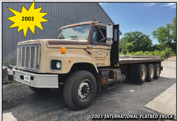
2003 INTERNATIONAL FLATBED TRUCK