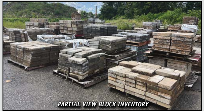
PARTIAL VIEW BLOCK INVENTORY