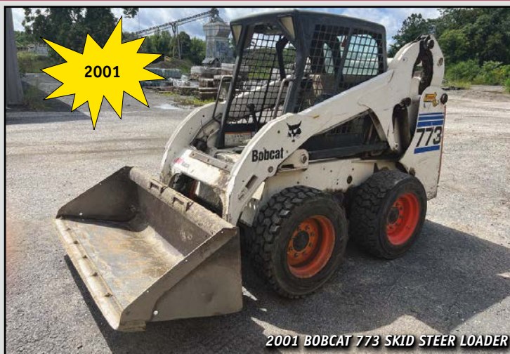
2001 BOBCAT 773 SKID STEER LOADER