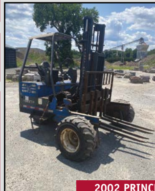
2002 PRINCETON FORKLIFT