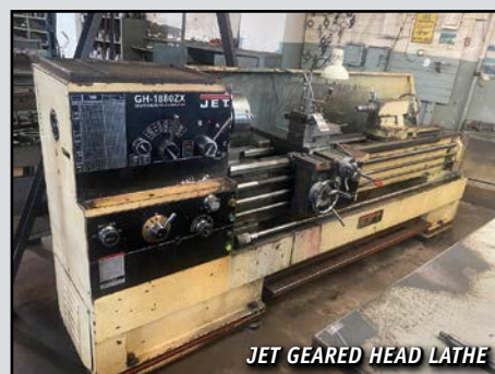
JET GEARED HEAD LATHE