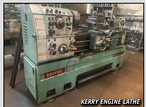
KERREY ENGINE LATHE