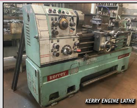
KERRY ENGINE LATHE

WEDNESDAY, SEPTEMBER 20 TH AT 11:00 A.M. (ET) 12 JACQUES STREET WORCESTER, MASSACHUSETTS