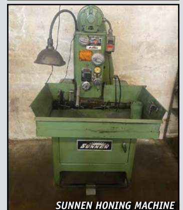
SUNNEN HONING MACHINE