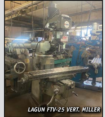
LAGUN FTV-25 VERT. MILLER