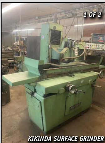
KIKINDA SURFACE GRINDER