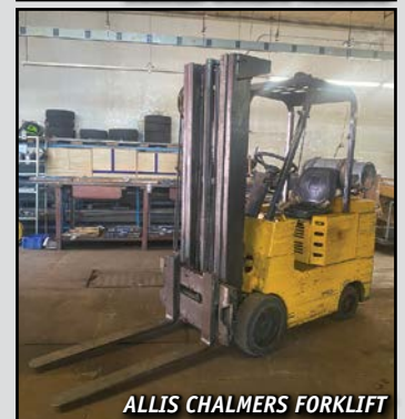
ALLIS CHALMERS FORKLIFT