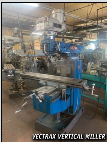
VECTRAX VERTICAL MILLER