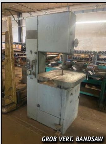
GROB VERT. BANDSAW