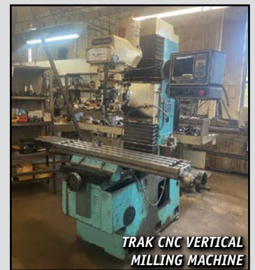
TRAK CNC VERTICAL MILLING MACHINE