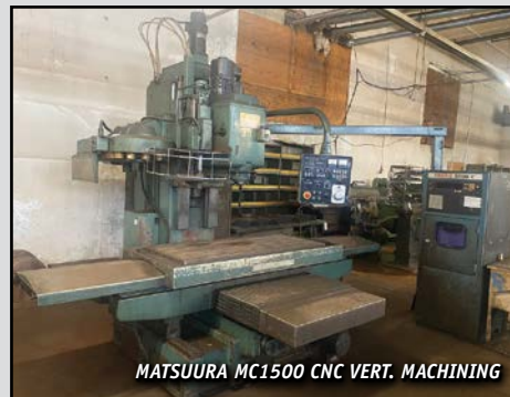
MATSUURA MC1500 CNC VERT. MACHINING

INSPECTIONS: TUESDAY, SEPTEMBER 19 TH - 10:00 A.M. TO 4:00 P.M. & MORNING OF SALE - 8:30 A.M. TO 11:00 A.M.