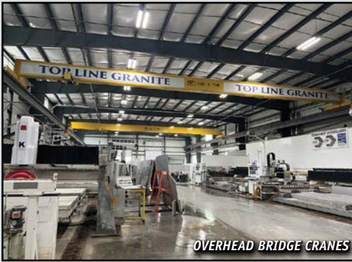
OVERHEAD BRIDGE CRANES