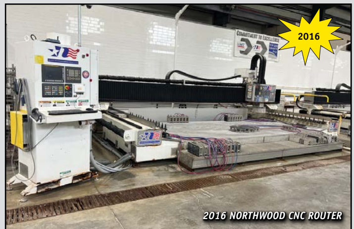
2016 NORTHWOOD CNC ROUTER