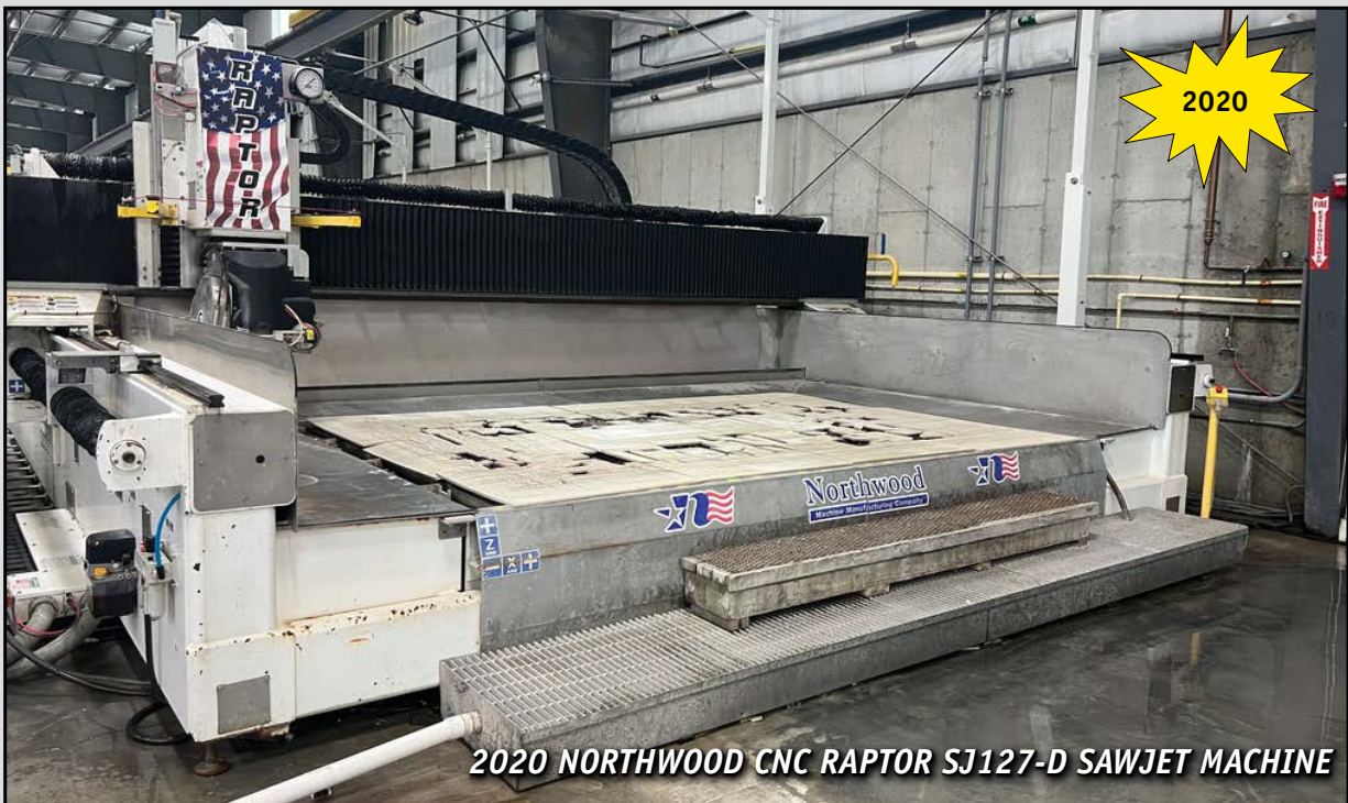
2020 NORTHWOOD CNC RAPTOR SJ127-D SAWJET MACHINE

INSPECTIONS: WEDNESDAY, SEPTEMBER 6 TH – 10:00 A.M. TO 4:00 P.M. & MORNING OF SALE – 8:30 A.M. TO 11:00 A.M.