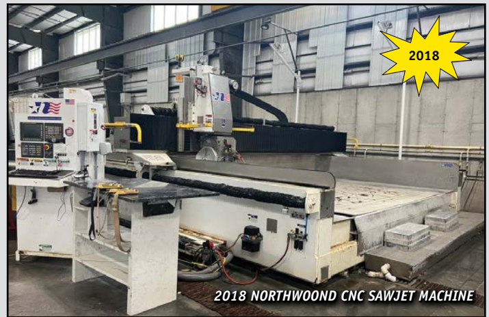
2018 NORTHWOOD CNC SAWJET MACHINE

THE INFORMATION DESCRIBED IN THIS BROCHURE IS CORRECT TO THE BEST OF OUR KNOWLEDGE BUT WE CANNOT GUARANTEE SAME. IT IS FOR THIS REASON THAT BUYERS SHOULD AVAIL THEMSELVES OF THE OPPORTUNITY FOR INSPECTION PRIOR TO THE SALE.