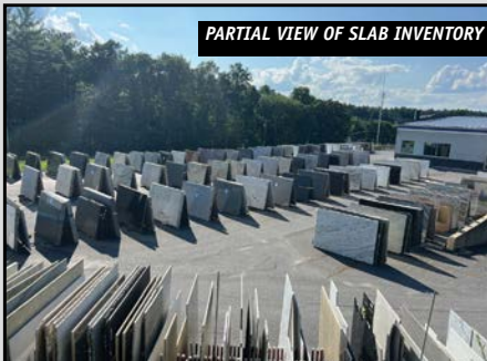
PARTIAL VIEW OF SLAB INVENTORY