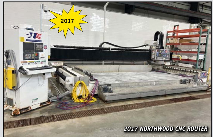
2017 NORTHWOOD CNC ROUTER