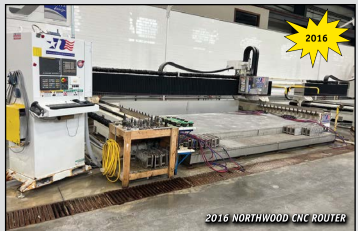
2016 NORTHWOOD CNC ROUTER