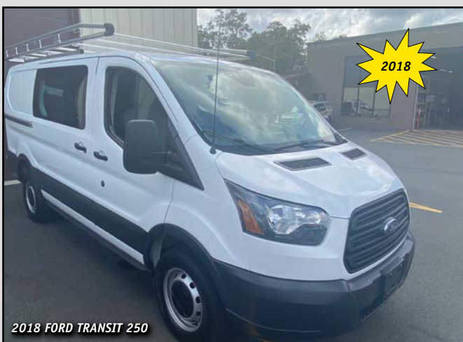
2018 FORD TRANSIT 250