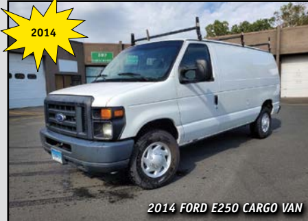
2014 FORD E250 CARGO VAN

15% BUYERS PREMIUM APPLIES ON ALL ONSITE PURCHASES 18% BUYERS PREMIUM APPLIES ON ALL ONLINE PURCHASES