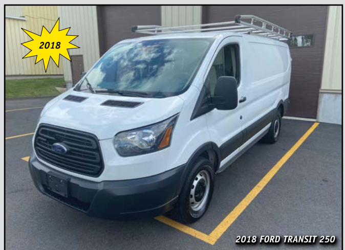
2018 FORD TRANSIT 250