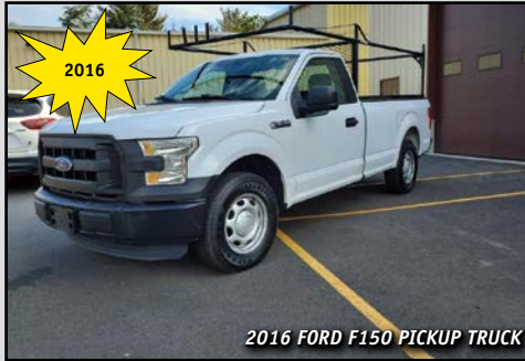
2016 FORD F150 PICKUP TRUCK

THE INFORMATION DESCRIBED IN THIS BROCHURE IS CORRECT TO THE BEST OF OUR KNOWLEDGE BUT WE CANNOT GUARANTEE SAME. IT IS FOR THIS REASON THAT BUYERS SHOULD AVALI THEMSELVES OF THE OPPORTUNITY FOR INSPECTION PRIOR TO THE SALE