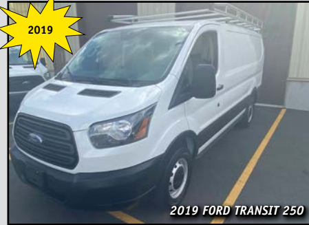
2019 FORD TRANSIT 250