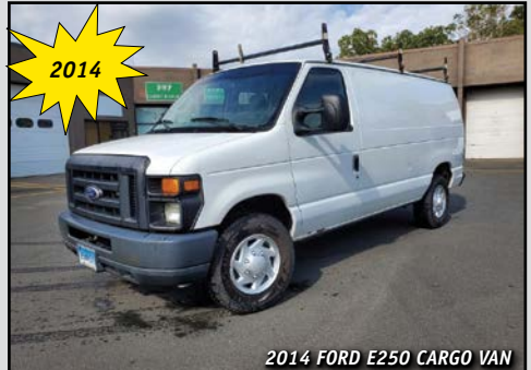
2014 FORD E250 CARGO VAN