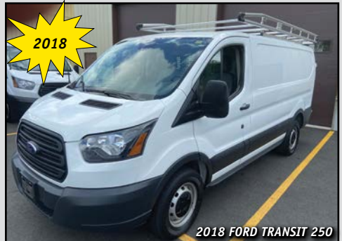
2018 FORD TRANSIT 250