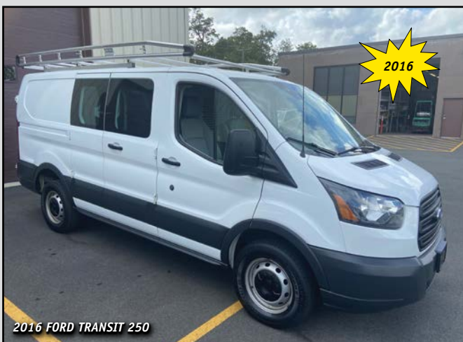
2016 FORD TRANSIT 250