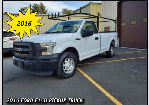
2016 FORD F150 PICKUP TRUCK