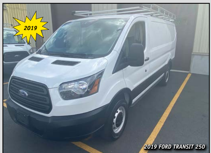
2019 FORD TRANSIT 250