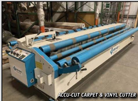
ACCU-CUT CARPET & VINYL CUTTER

INSPECTIONS: WEDNESDAY, JANUARY 22 ND - 10:00 A.M. TO 4:00 P.M. & MORNING OF SALE - 8:30 A.M. TO 11:00 A.M.