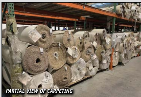
PARTIAL VIEW OF CARPETING

THURSDAY, JANUARY 23 RD AT 11:00 A.M. 1195 MONTGOMERY STREET CHICOPEE MASSACHUSETTS