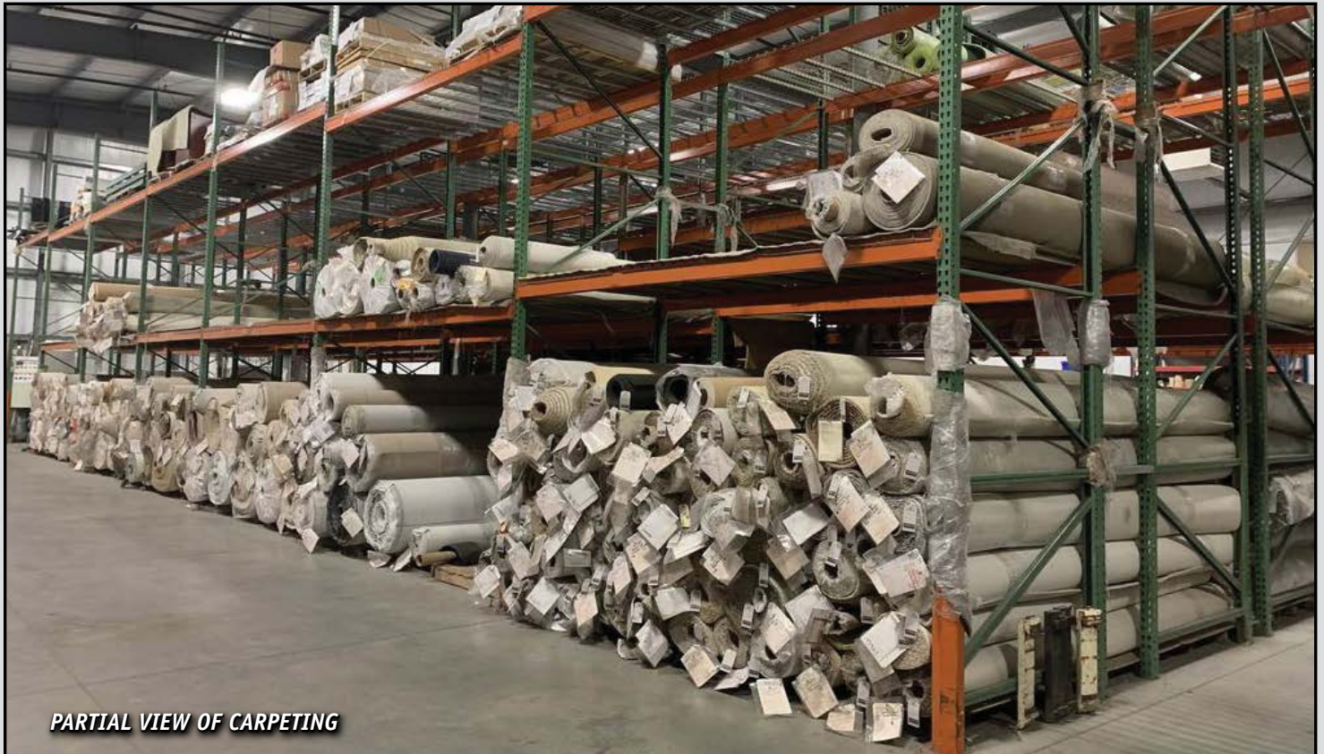
PARTIAL VIEW OF CARPETING