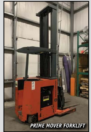
PRIME MOVER FORKLIFT