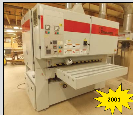
TIMESAVERS 50" BELT SANDER