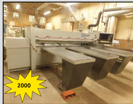
HOLZMA PANEL SAW, HPP 82/31

THE INFORMATION DESCRIBED IN THIS BROCHURE IS CORRECT TO THE BEST OF OUR KNOWLEDGE BUT WE CANNOT GUARANTEE SAME. IT IS FOR THIS REASON THAT BUYERS SHOULD AVAIL THEMSELVES OF THE OPPORTUNITY FOR INSPECTION PRIOR TO THE SALE.