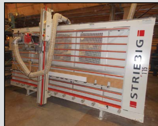
STRIEBERG PANEL SAW