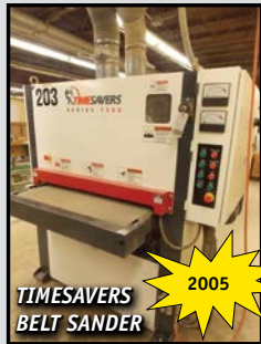
TIMESAVERS BELT SANDER