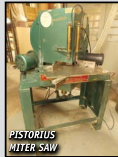
PISTORIUS MITER SAW