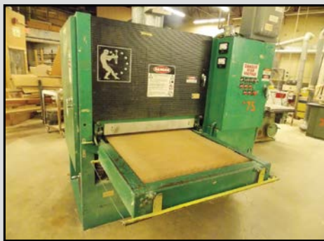
TIMESAVERS BELT SANDER