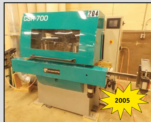
U.S. CONCEPTS STAIR TRENCHER