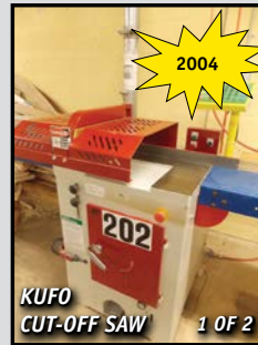
KUFO CUT-OFF SAW