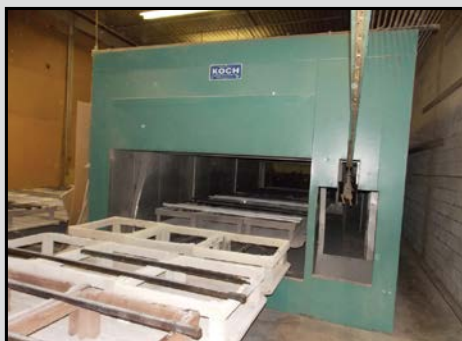
KOCH CONVEYOR OVEN