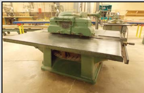
MATTISON 202 RIP SAW