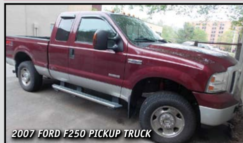
2007 FORD F250 PICKUP TRUCK