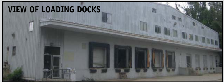
VIEW OF LOADING DOCKS