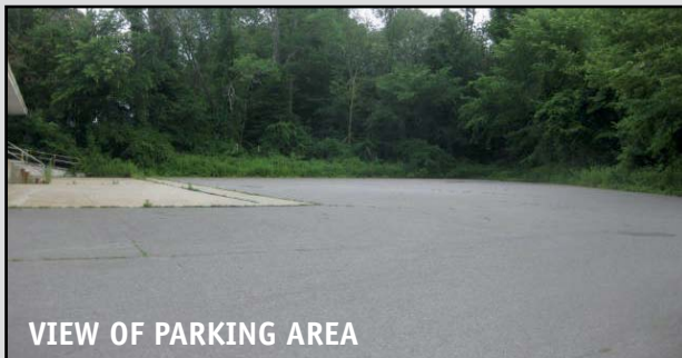
VIEW OF PARKING AREA