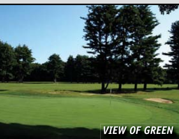
VIEW OF GREEN