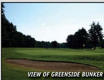
VIEW OF GREENSIDE BUNKER