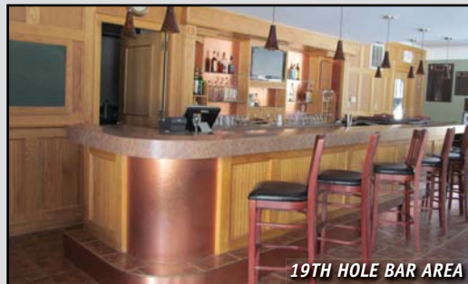
19TH HOLE BAR AREA

Terms of Sale: (to be Sold in its Entirety & Individual Lots) 25% Deposit Cash Or Certified Check 10% Buyers Premium Applies Other Terms to be Announced at Time of Sale Inspections: Sat., March 3 rd - 10:00 A.M. To 3:00 P.M. & Morning of Sale - 8:30 A.M. to 1:00 P.M. or Upon Request