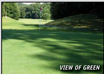
VIEW OF GREEN