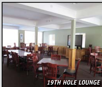
19TH HOLE LOUNGE