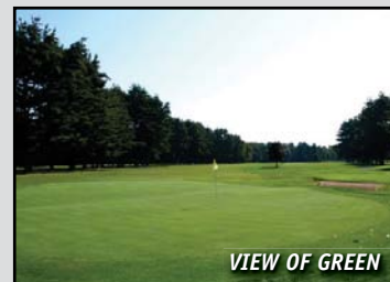
VIEW OF GREEN