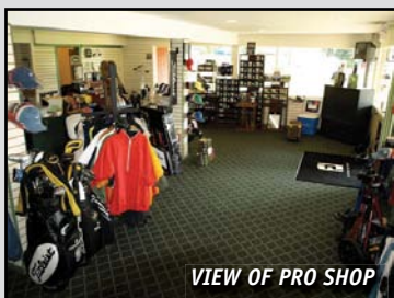
VIEW OF PRO SHOP