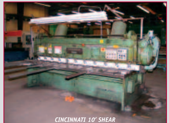
CINCINNATI 10' SHEAR