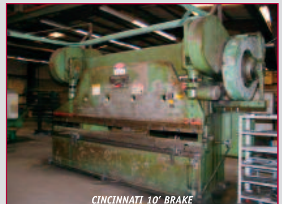
CINCINNATI 10' BRAKE