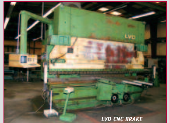
LVD CNC BRAKE

THE INFORMATION DESCRIBED IN THIS BROCHURE IS CORRECT TO THE BEST OF OUR KNOWLEDGE BUT WE CANNOT GUARANTEE SAME. IT IS FOR THIS REASON THAT BUYERS SHOULD AVAIL THEMSELVES OF THE OPPORTUNITY FOR INSPECTION PRIOR TO THE SALE.