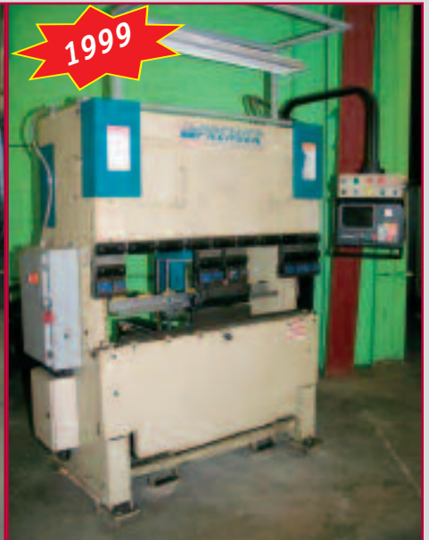
PREMIER CNC BRAKE