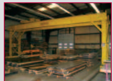
10 TON CRANE