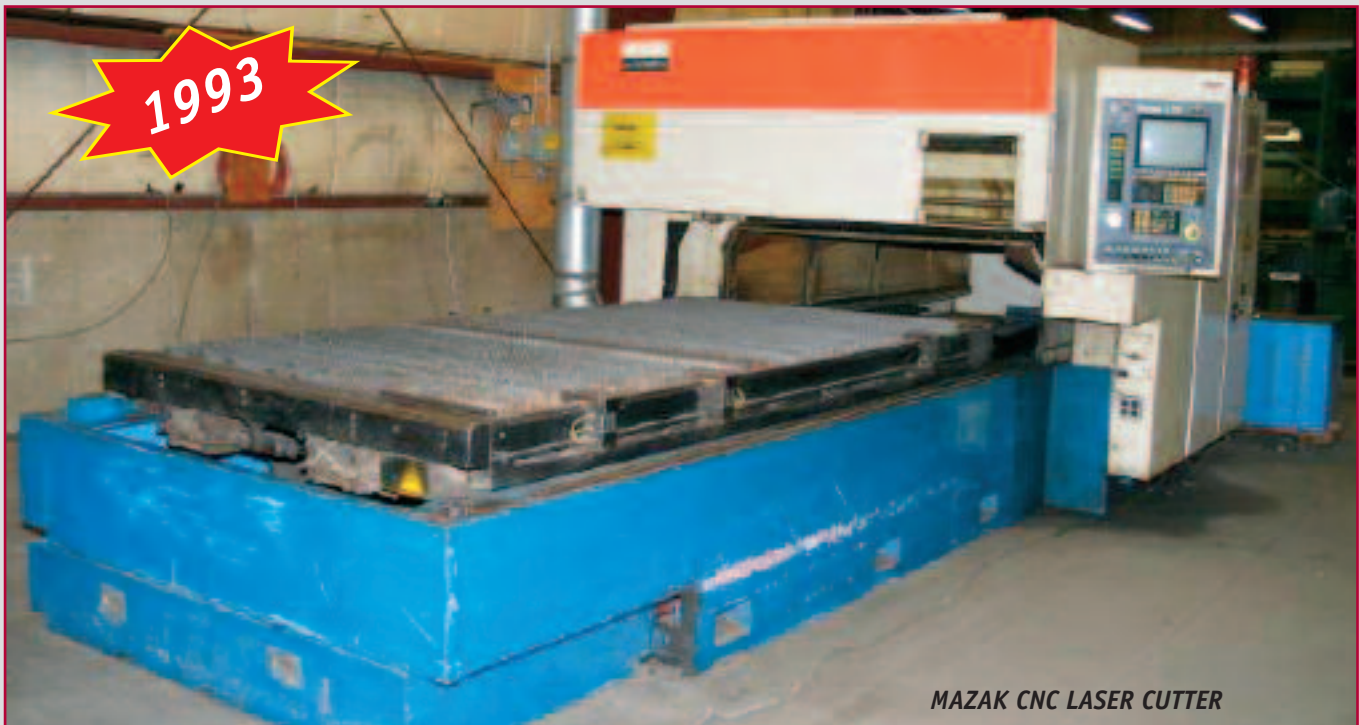
MAZAK CNC LASER CUTTER

INSPECTION: TUESDAY, OCTOBER 25 TH - 10:00 A.M. TO 4:00 P.M. & MORNING OF SALE - 8:30 A.M TO 11:00 A.M.