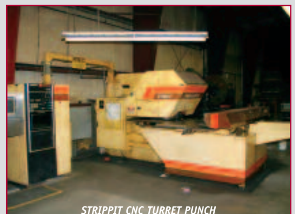
STRIPIIT CNC TURRET PUNCH