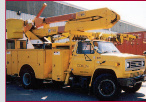
1980 CHEVY BUCKET TRUCK