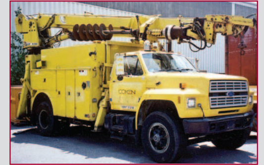
1985 FORD LINE TRUCK