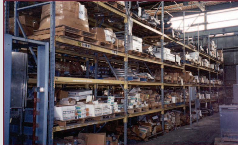
PARTIAL VIEW OF ELECTRICAL INVENTORY

National Brand Inventory Including: AB, Appleton, ARL, ASC, Bridge, Carlon, Cutler Hammer, Caddy, GE, Gendy, Gould, Grouse, Hoffman, Hubble, ITE, Leviton, Lutron, Midwest, Mulbury, Neer, OZ, Paragon, Raco, Red Dot, Siemens, Square D, Topaz, Walker, Westinghouse, Etc.