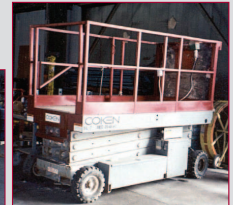
1995 MEC SCISSOR LIFT