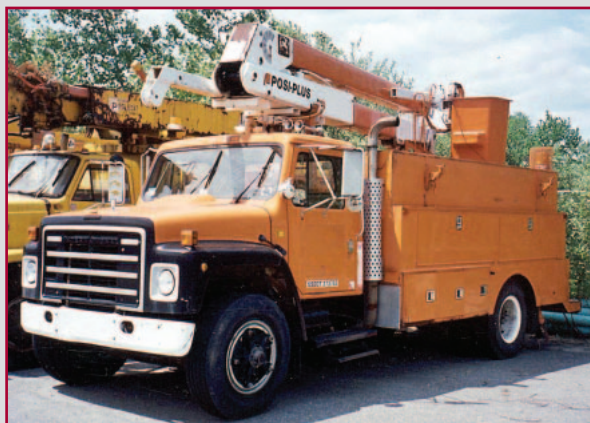
1984 I.H. BUCKET TRUCK