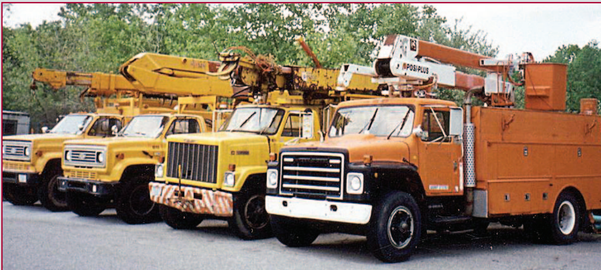
VIEW OF BUCKET AND LINE TRUCKS

INSPECTION: WEDNESDAY, JUNE 18 TH - 10:00 A.M. to 4:00 P.M. MORNING OF SALE 8:30 A.M. - 10:30 A.M.