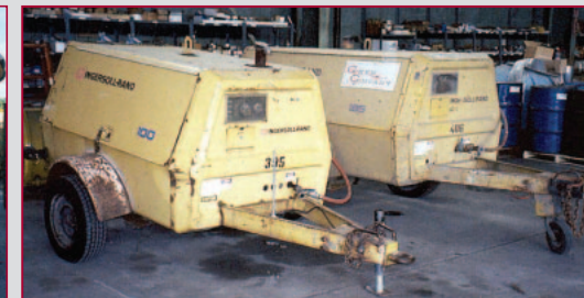
I.R. TAG COMPRESSORS