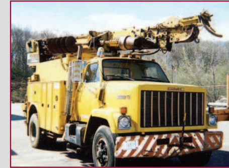
1983 GMC LINE TRUCK