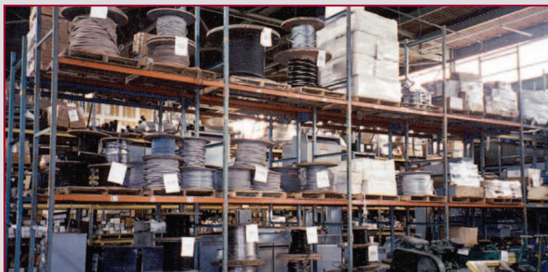
PARTIAL VIEW OF ELECTRICAL INVENTORY