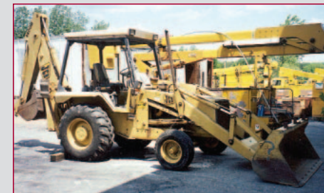
JCB 1400B LOADER/BACKHOE